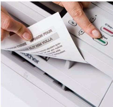
Fast and efficient printing and copying at speeds of up to 20 ppm

The DCP-7055 comes complete with a range of easy-to-use software utilities to improve your productivity. Bundled with the powerful Scansoft® Paperport™ document management software, hard copy documents such as invoices can be scanned in colour, stored and managed electronically for future retrieval.