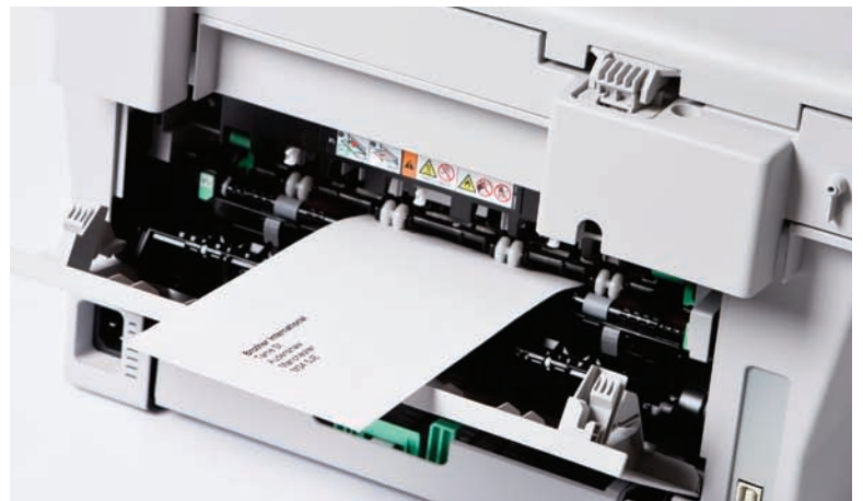
Print on thicker media and envelopes using the manual feed slot